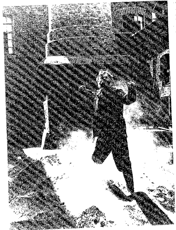
49 (top) Tisse filming Potemkin . Eisenstein rejected Balázs's elevation of cinematography and the individual shot, insisting instead on the collectivity of his group's work and on the primacy of montage. 50 (bottom left) Esfir Shub. 51 (bottom right) Pudovkin's The Mother (1926) confirmed the promise of 'a remarkable blossoming of Russian cinematography'. But Lunacharsky warned against excessive avant-gardism: 'We must know how to attract our great public to our own films.'

P am a 'Ame debu / new hone rati wha cons as p spac nec exp reg pos 191 (as