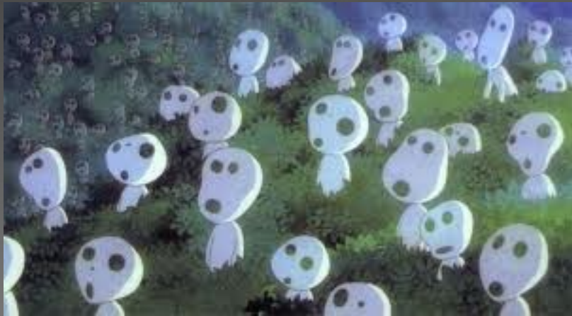
Tree Spirits from Princess Mononoke