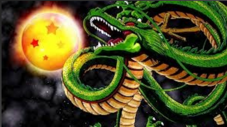
Dragon Spirit/God in Dragon Ball Z